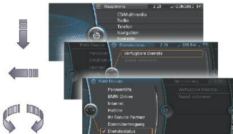
Vehicle Info menu

Further entries or information are linked to each menu item.